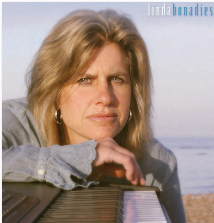
No Regret - 2004